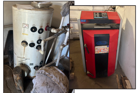
Old heating systems in Bradet needing replaced

E xpenses at Bradet and St Anton's to keep the facilities in working order over the winter are on going. We are asking for your prayers and support in this.