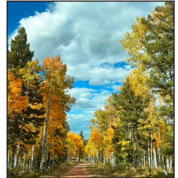
Colorado's beautiful aspen's.